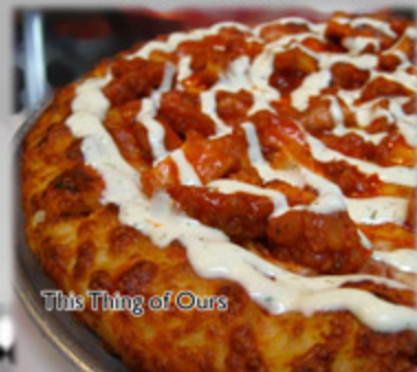
This Thing of Ours