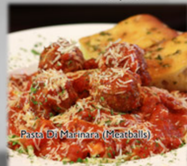
Pasta Di Marinara (Meatballs)