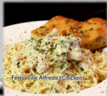
Fettuccine Alfredo (Chicken)