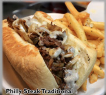
Philly Steak Traditional