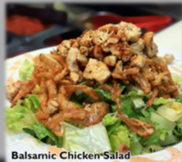
Balsamic Chicken Salad